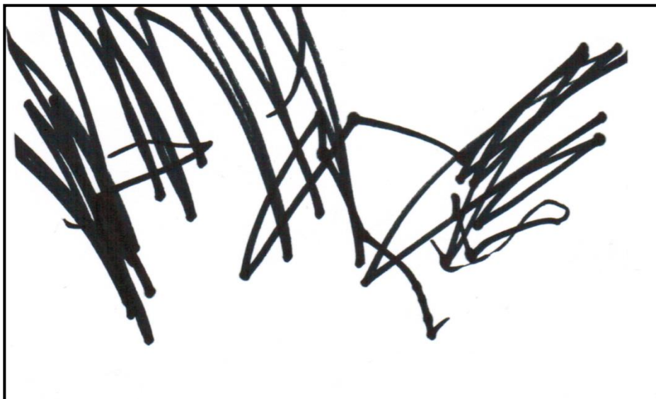
Early mark making

The environment is carefully set up to be homely; for children to discover, explore, experiment and problem solve, and is crafted around children's interests and skills, teachers' provocations, and seasonal conditions.